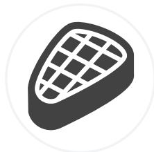
AAA ALBERTA PRIME RIB