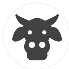
AAA ALBERTA ROAST BEEF