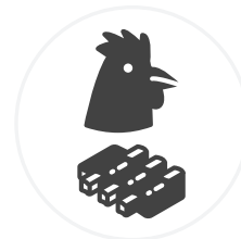
1/4 BBQ CHICKEN + 1/2 RACK OF BBQ RIBS