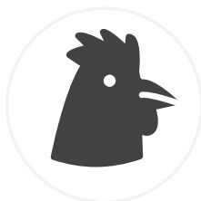
BBQ CHICKEN BREAST